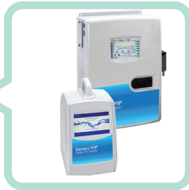
M9e On-Line and Portable 0.03 ppb – 50 ppm