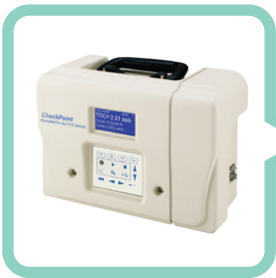
CheckPoint Pharma: 0.21 ppb – 1,000 ppb eModel: 0.05 ppb – 1,000 ppb