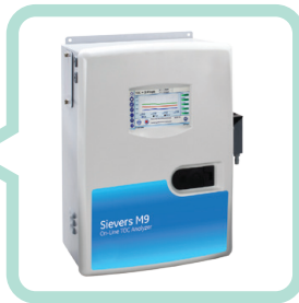
M9 On-Line 0.03 ppb – 50 ppm