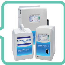
M5310 C Laboratory, Portable, On-Line 4 ppb to 50 ppm