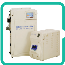
InnovOx Laboratory and On-Line 50 ppb to 50,000 ppm