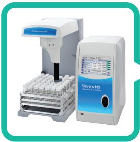
M9 Laboratory and Autosampler 0.03 ppb – 50 ppm