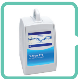
M9 Portable 0.03 ppb – 50 ppm